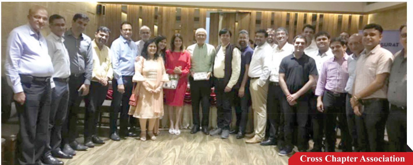
Cross Chapter Association

TiE Surat is a new Chapter but one can find numerous similarities between the entrepreneurial ecosystem of Surat and Jaipur. Such cross chapter interactions will help stimulate innovative ideas and learn from other chapters.