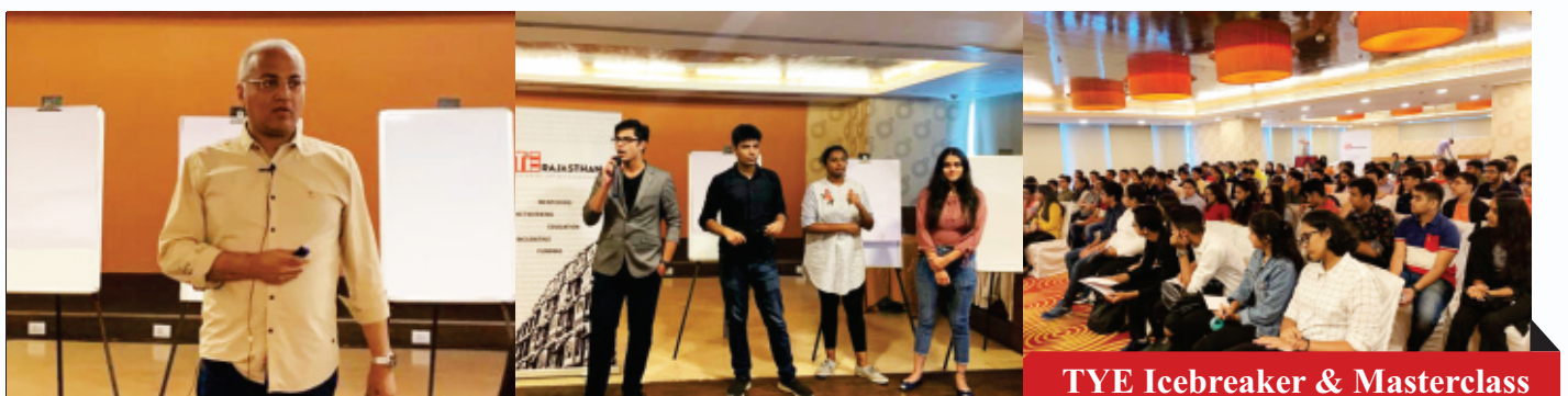
TYE Icebreaker & Masterclass

Prior to this, recent winners of TYE global competitions (Team Jhutpat & Team Phoolvari) were invited from New Delhi at the Icebreaker Session to present the TYE concept, their TYE experiences and most importantly their own TYE winning formula.