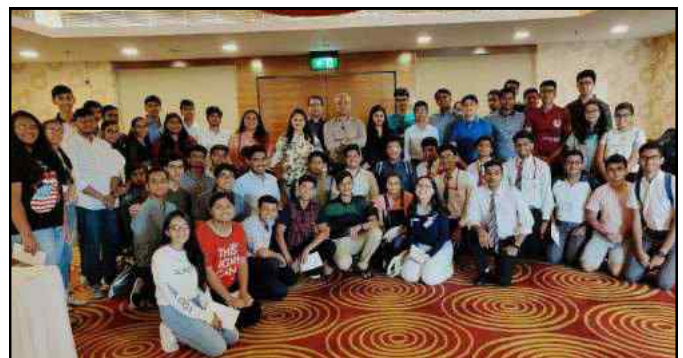
TYE participants with TiE team. 130+ students are participating in TYE program at TiE Rajasthan this year.

TiE Nxt, a unique membership for students in age group 14–21 years and TiE Young Entrepreneurs (TYE), a global business plan competition are our instruments to reach out to young minds and nurture the seed of entrepreneurship there. Structured classroom sessions on starting up followed by one on one mentoring by TiE mentors are helping them understand the basics of startup business. TiE Nxt saw an increase in membership with 32 members enrolling in 2018.