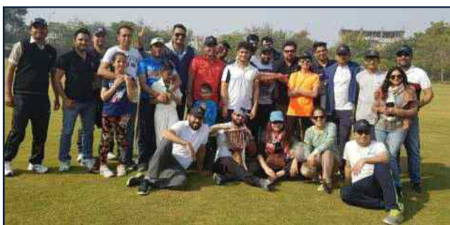
TiE Member Cricket League