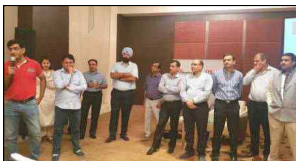
TiE Member Networking Dinner